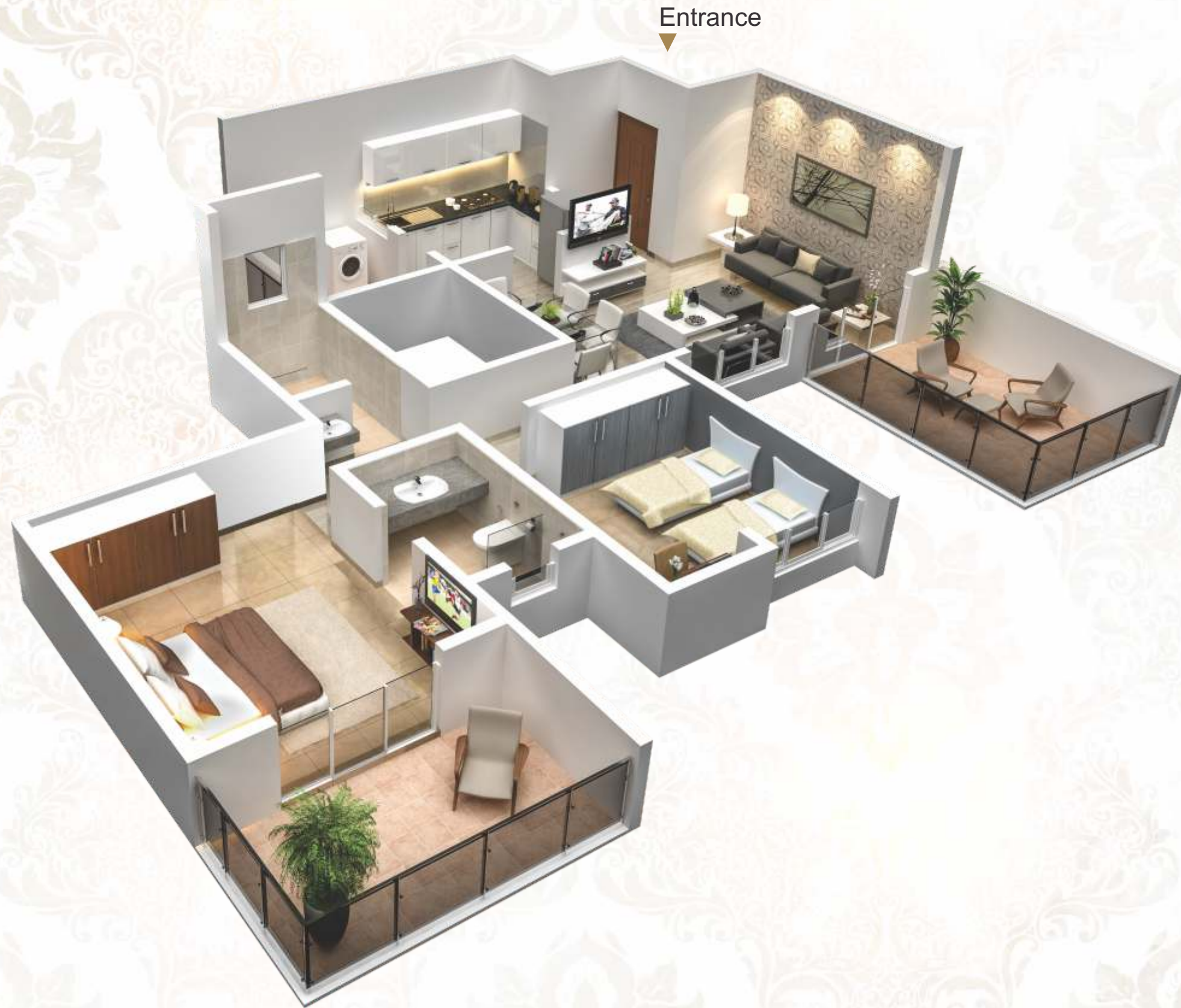
ISOMETRIC VIEW - 2 BR